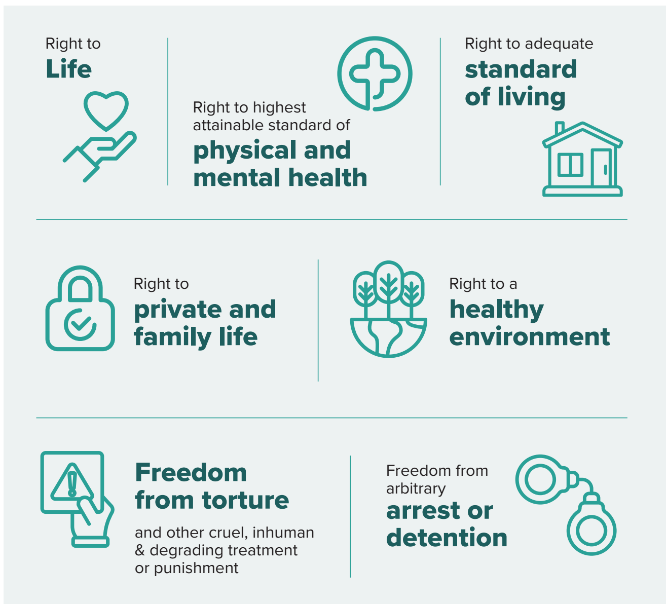
Figure 2: 'Key Rights' outlined in the Charter

The Charter is accompanied by a comprehensive Toolkit that provides guidance to both duty-bearers and rights-holders as well as examples of emerging practice. This includes how to apply the FAIR Approach - a recommended model for putting a human rights-based approach into practice. This involves understanding the facts and experiences of people affected; analysing the human rights at stake; identifying what actions are required and who is responsible for them; and reviewing and evaluating the outcomes to ensure accountability and continuous improvement.